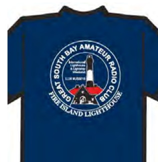
Rear of Shirt

The price for all sizes is $25 for “T” Shirt and $30 for Long Sleeve.