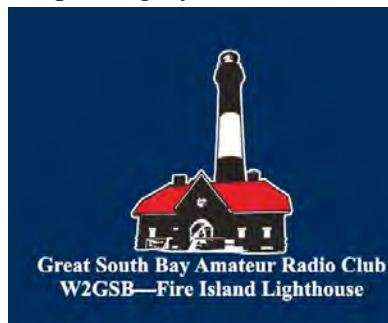
Front of Shirt

These are high quality “Dri-Fit” shirts that wick moisture away. They are available in Tan (KAKI), Navy Blue, Graphite (grey), sizes Small to 3X.